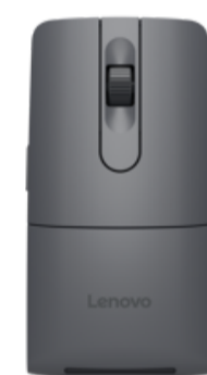
ThinkPad Bluetooth Presenter Mouse (Aura Edition)