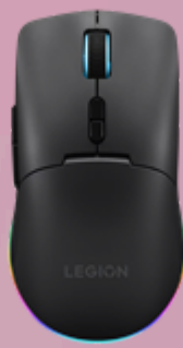
Lenovo Legion M220 Wireless RGB Gaming Mouse GY51U28359

Lenovo may not offer the products, services or features discussed in this document in all regions. Lenovo may withdraw an offering at any time. Information is subject to change without notice. Consult your local representative for information on offerings available in your area. Lenovo reserves the right to change specifications or other product information without notice. Lenovo is not responsible for photographic or typographical errors. Lenovo provides this publication "as is" without warranty of any kind, either express or implied, including the implied warranties of merchantability or fitness for a particular purpose.