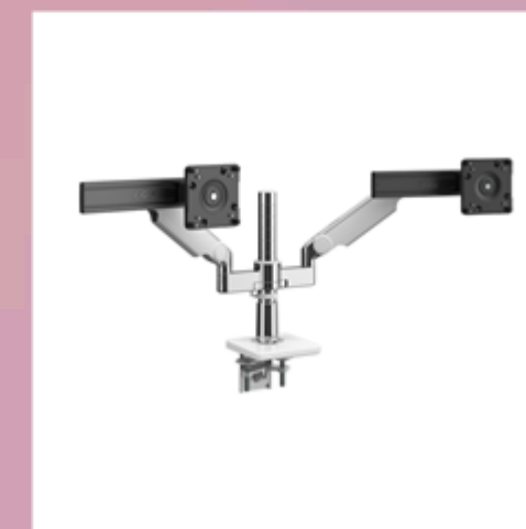
Humanscale Dual Monitor Arm White 4ZE1U10767