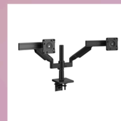
Humanscale Dual Monitor Arm Black 4ZE1U10766

Please click here to view the full list of accessories.