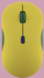
Lenovo 350 Bluetooth Silent Mouse (Fan Edition - Brazil) GY51U71760