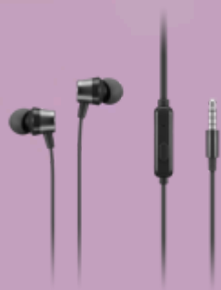
Lenovo Analog In-Ear Headphones Gen II Bulk Package (20pcs) 4XD1T54899

Please click here to view the full list of accessories.