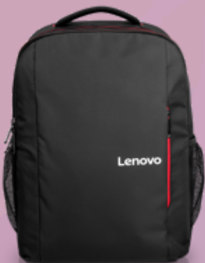
Lenovo 15.6 Laptop Everyday Backpack B510-ROW 4X41U80414