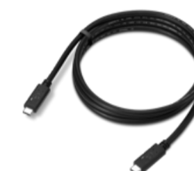
Lenovo USB 20Gbps USB-C to USB-C Cable 1.5m