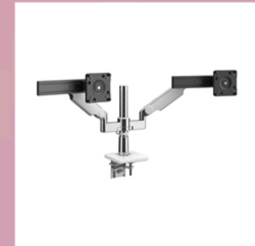
Humanscale Dual Monitor Arm White 4ZE1U10767