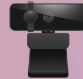
Lenovo Essential FHD Webcam Gen2 4XC1S15018

Please click here to view the full list of accessories.