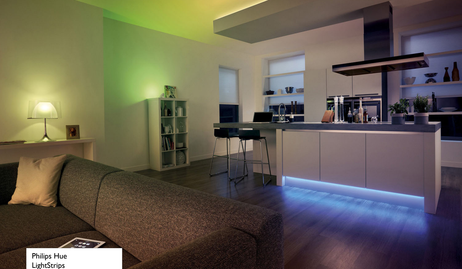
Philips Hue LightStrips