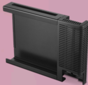
ThinkCentre Tiny Mounting Kit 4XF1R07369

Lenovo may not offer the products, services or features discussed in this document in all regions. Lenovo may withdraw an offering at any time. Consult your local representative for information on offerings available in your area. Lenovo reserves the right to change specifications or other product information without notice. Lenovo is not responsible for photographic or typographical errors. Lenovo provides this publication "as is" without warranty of any kind, either express or implied, including the implied warranties of merchantability or fitness for a particular purpose.